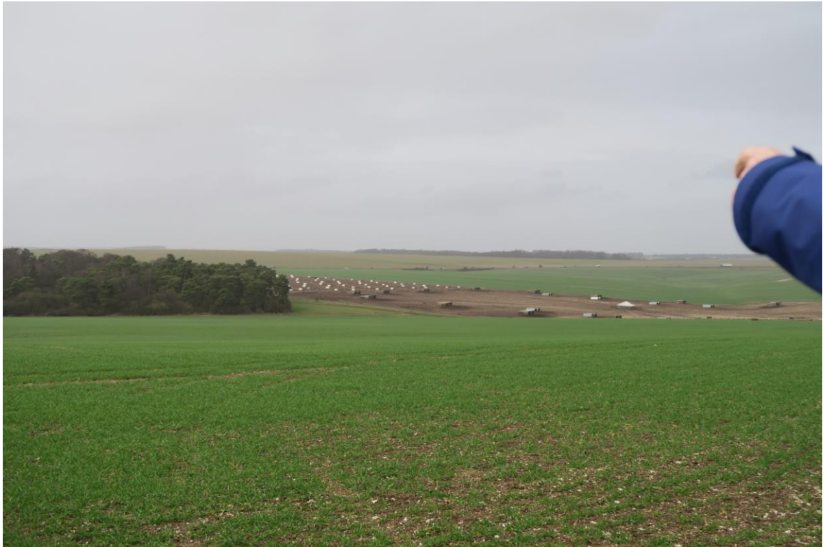
Fig. 6.4.3 - Western portal site at 1 to 30.000 - 2016 by Highways England