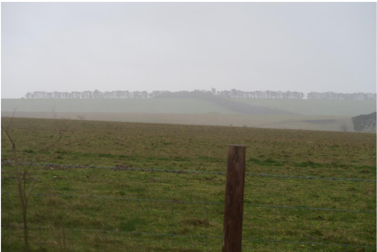
Fig. 6.4.5 - Pig farm seen from Long Barrow